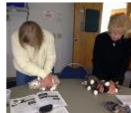
Niagara County CART Animal First Aid & CPR Training 2014