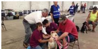
Niagara County CART Animal Sheltering Exercise 2014