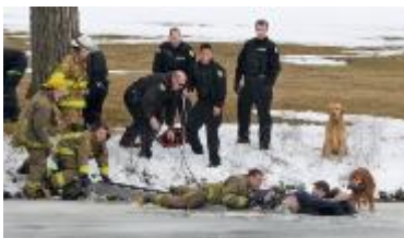
“Niagara Falls Ice Rescue”

To meet the needs of animals, Niagara County created a CART under the Empire State Animal Response Team (ESART) program. Niagara County Department of Health Division of Planning and Emergency Preparedness manages one of two regional trailers which house a small cache of animal sheltering equipment and supplies.