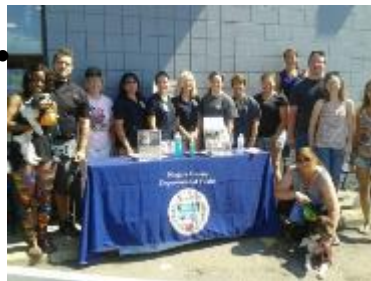
Niagara County CART Microchip Clinic 2013