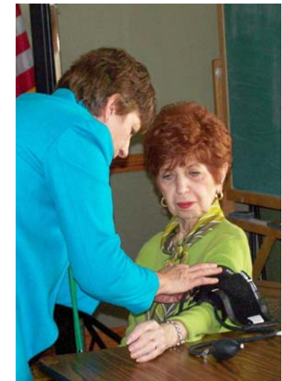
Weekly blood pressure taken.